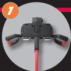
2 Position Handle