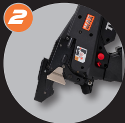
2 Nose attachments available for different distance from ground