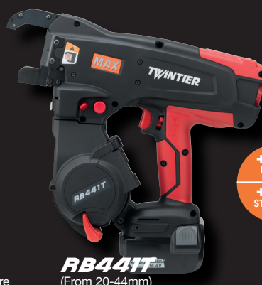
RB441T (From 20-44mm)