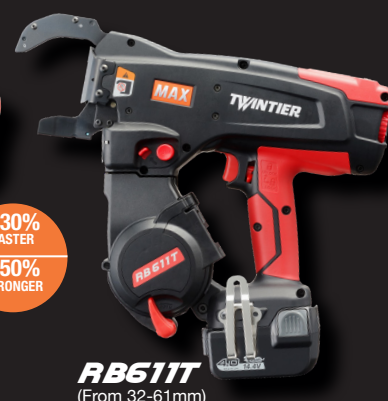
RB611T (From 32-61mm)